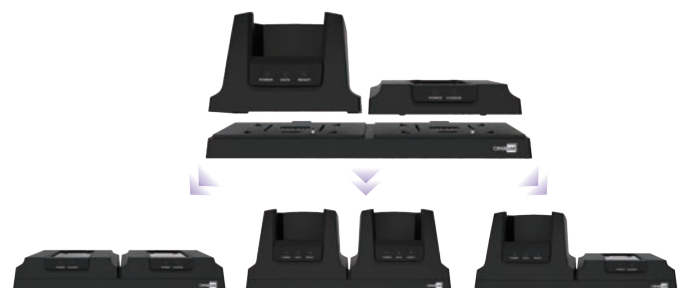
Modular Charging and Communication System

The 8600 series' flexible design comes with swappable keypads which give the 8600 series the power to easily swap between 29 or 39 keys when it is necessary. The 8600 series also comes equipped with a modular system which provides various combinations of charging / communication cradles and battery chargers. This makes the initial configuration modification very simple. This flexible design will also assist in reducing the inventory level while providing more cost-effective re-configurations for end users. Additionally, it will also make repair and replacement process easier and quicker.