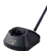
3G Cradle / GPRS Cradle (Quad Band)