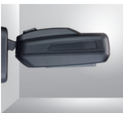
Locking Mount Bracket